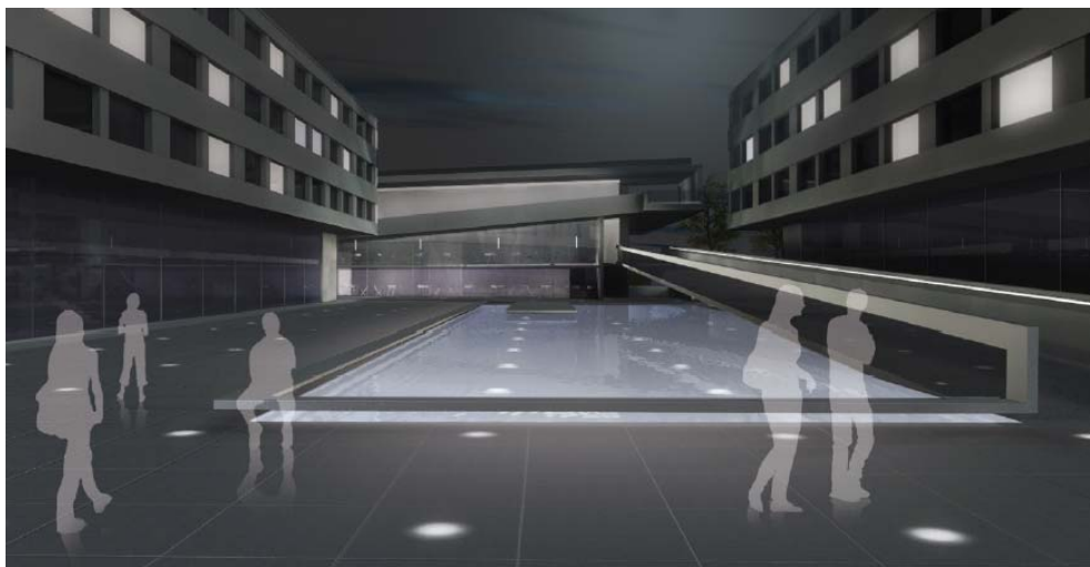
Illumination concept of Brückenplatz