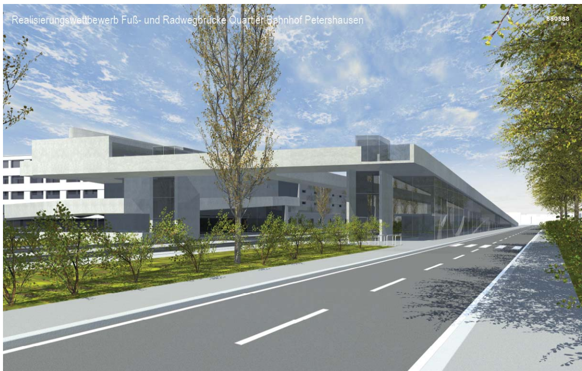
View to Gustav-Schwab-Street direction west

The connection of two suburbs by means of a foot- and cycle bridge across a busy railway station was the topic of this competition. Also included in the competition brief was the design of the square adjacent to the railway area. In the present proposal the connection was achieved through the specific structure of the bridge and the particular lighting of the bridge and the square. The design of the square was governed by a pool situated next to the ramp leading up to the bridge which also includes space for a cafe or similar usage.