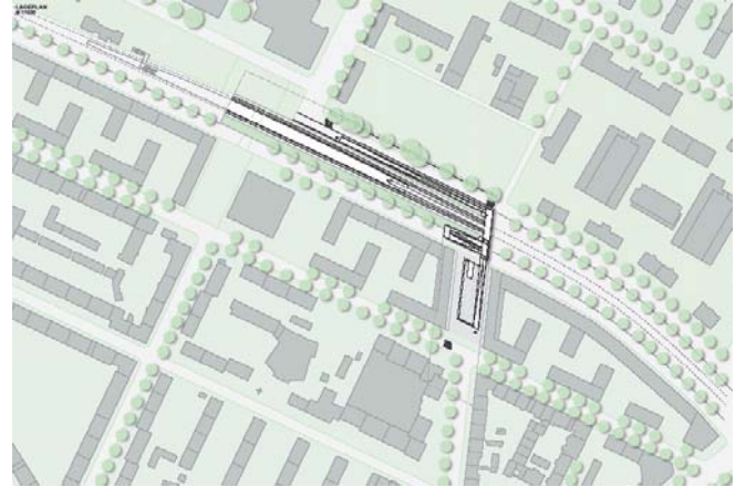
Plan of site