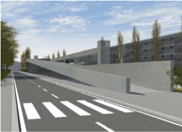
View to Gustav-Schwab-Street direction East